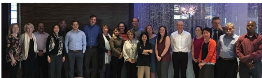
Team Photo taken at the Technical Steering Committee Meeting, Rosebank, Johannesburg, 24 May 2017

The OPTIMIZE consortium had a very successful 3-day Technical Steering Committee meeting. CHAI participated on day 1 and 2, and Unitaid was able to participate in the entire meeting. The meeting was instrumental in providing guidance on priorities for the 3 rd year of funding, including discussions on clinical studies that are required to answer outstanding questions on both 1 st and 2 nd line ART.